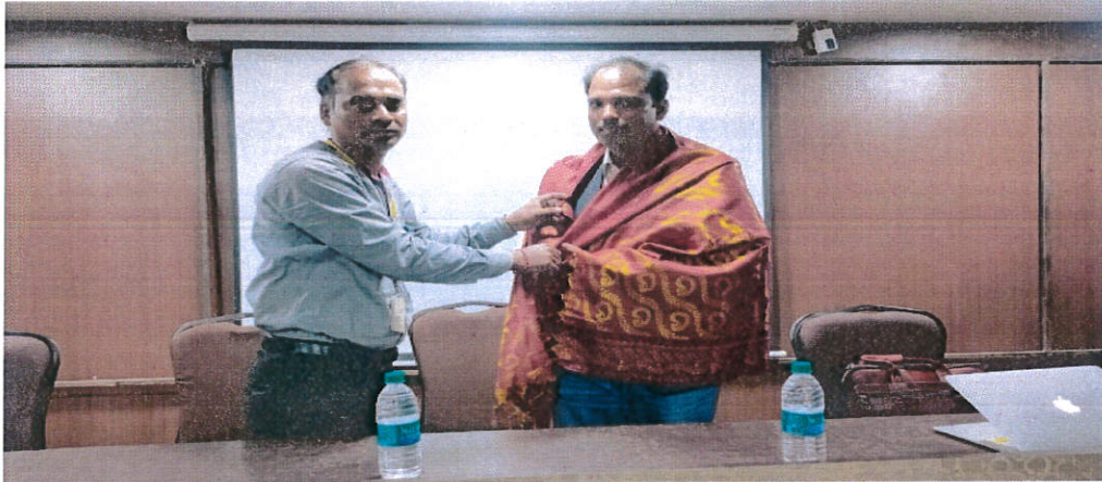
Fig 1 Chief Guest being greeted by the Head of the Mechanical Department