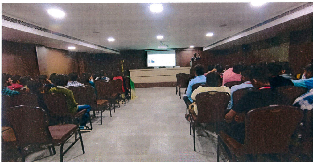
Fig 3 Chief Guest addressed the participants